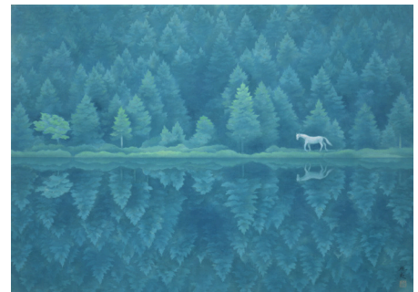
Higashiyama Kaii, Vibrant Greens , 1982