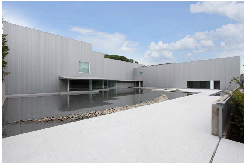
Higashiyama Kai Gallery exterior

— Featuring Evening Star , the artist's final work, in connection with the anniversary of his passing on 6 May —