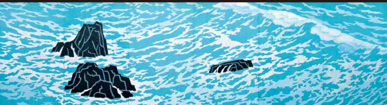
Dawn Tide , full-size underdrawing, 1967, Nagano Prefectural Art Museum

The Eternal Sea—I Am Listening Now to the Sound of the Waves